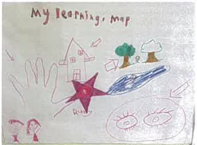
Learning Map by Ruby